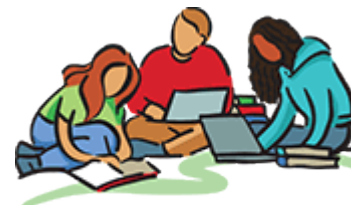
Pray for Our College Students

Please be advised, you must be an ACTIVE MEMBER of the congregation and be present on December 1st when scholarships are given out during the worship service.